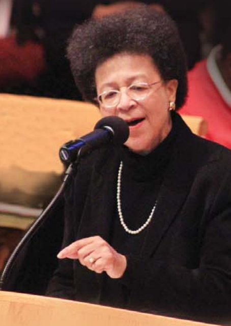
Doctor of Psychology Director of the Evangelistic Task Force - ABCN