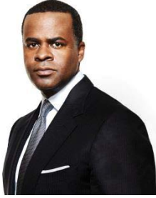
KASIM REED MAYOR