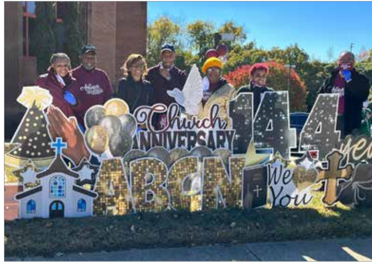
Antioch participants at the 144th Anniversary Drive-thru

"You're still a beacon of hope, a hospital for wounded souls, still an open door for the marginalized and overlooked," he said. "You're still on the battlefield, still ministering to the sick, preaching the gospel, still