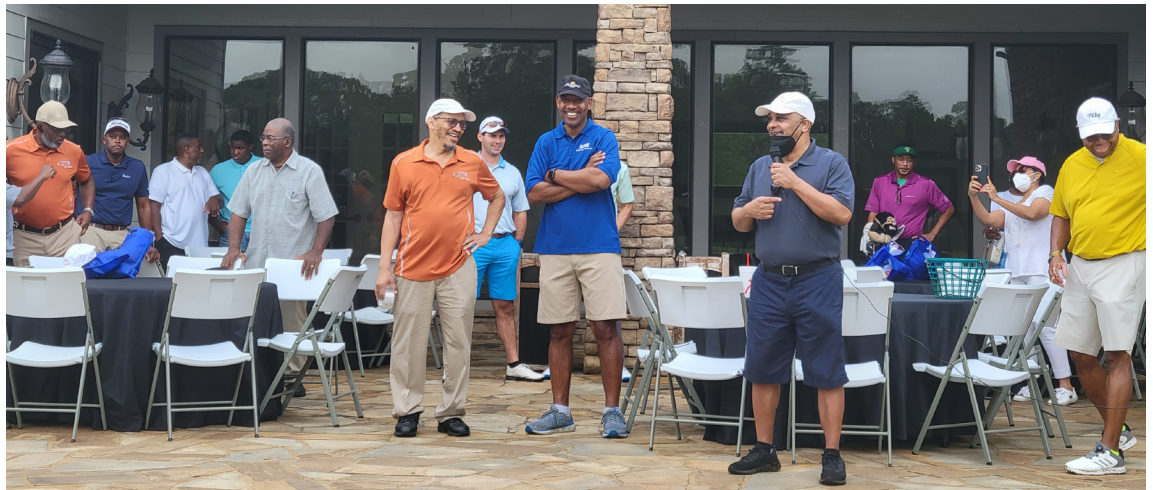
Participants prepare for a day of golfing at the CMA Golf Classic.