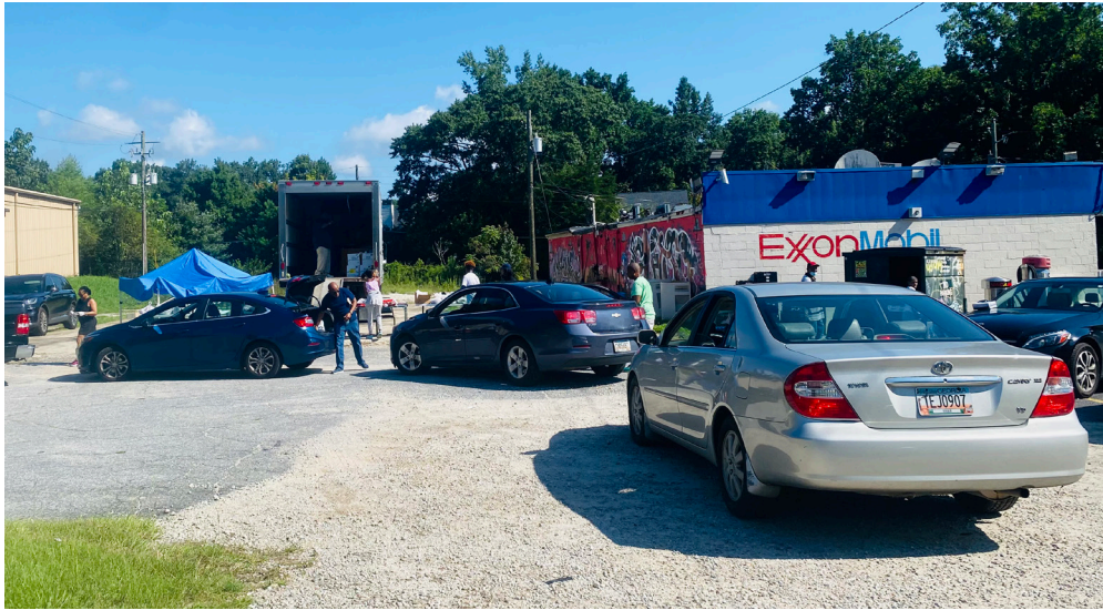
Cars drive through during the pop-up.

mentioned she'd run out of Food Stamps. Vincent gave her food and the name of our church.