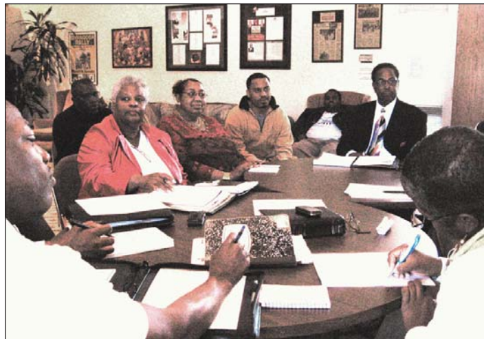
Antioch members attend an Antioch empowerment meeting

“I have never been involved in anything in the church be-