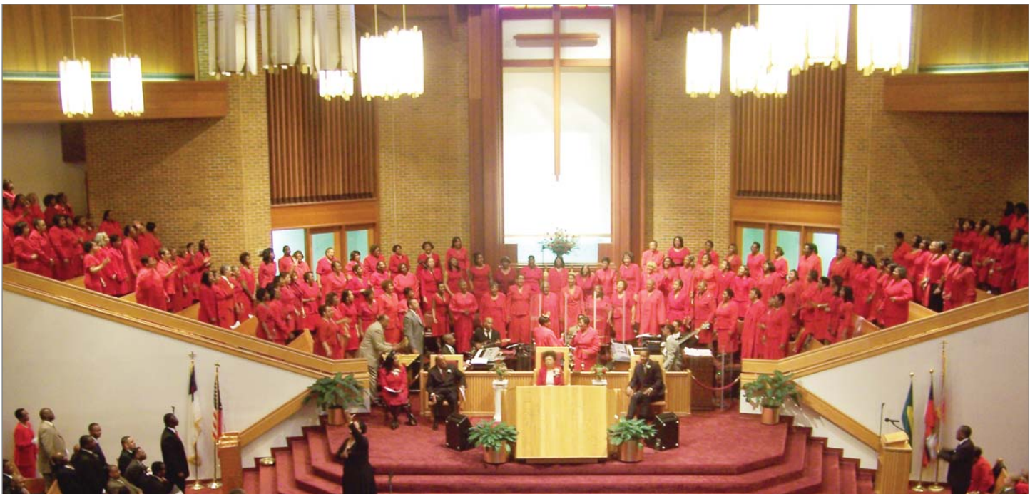
The women in red at the Women's Division Culmination was a sight to behold!