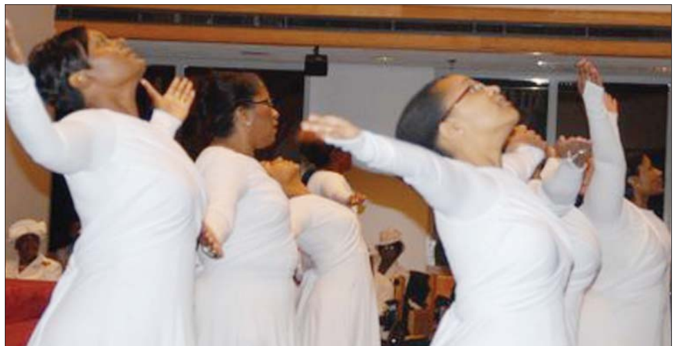
The Women's Culmination dancers