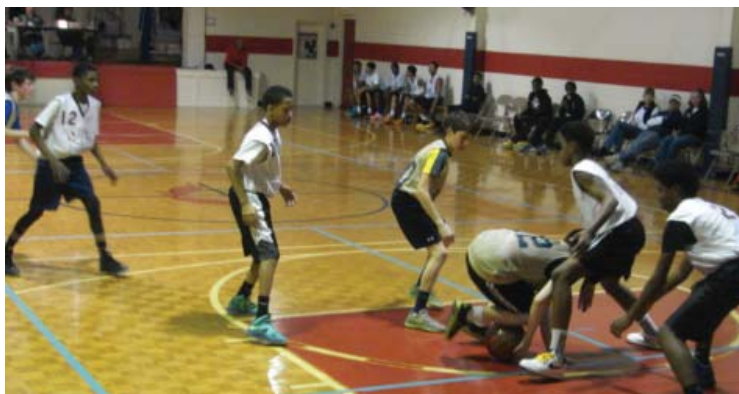
Antioch Panthers scramble for the ball against Chamblee