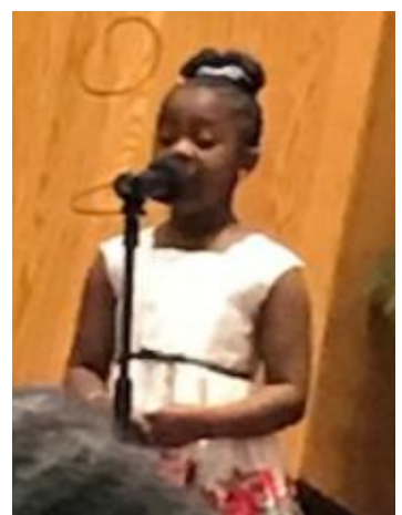
In keeping with the Easter tradition, dozens of Antioch youth offered speakers celebrating the day.