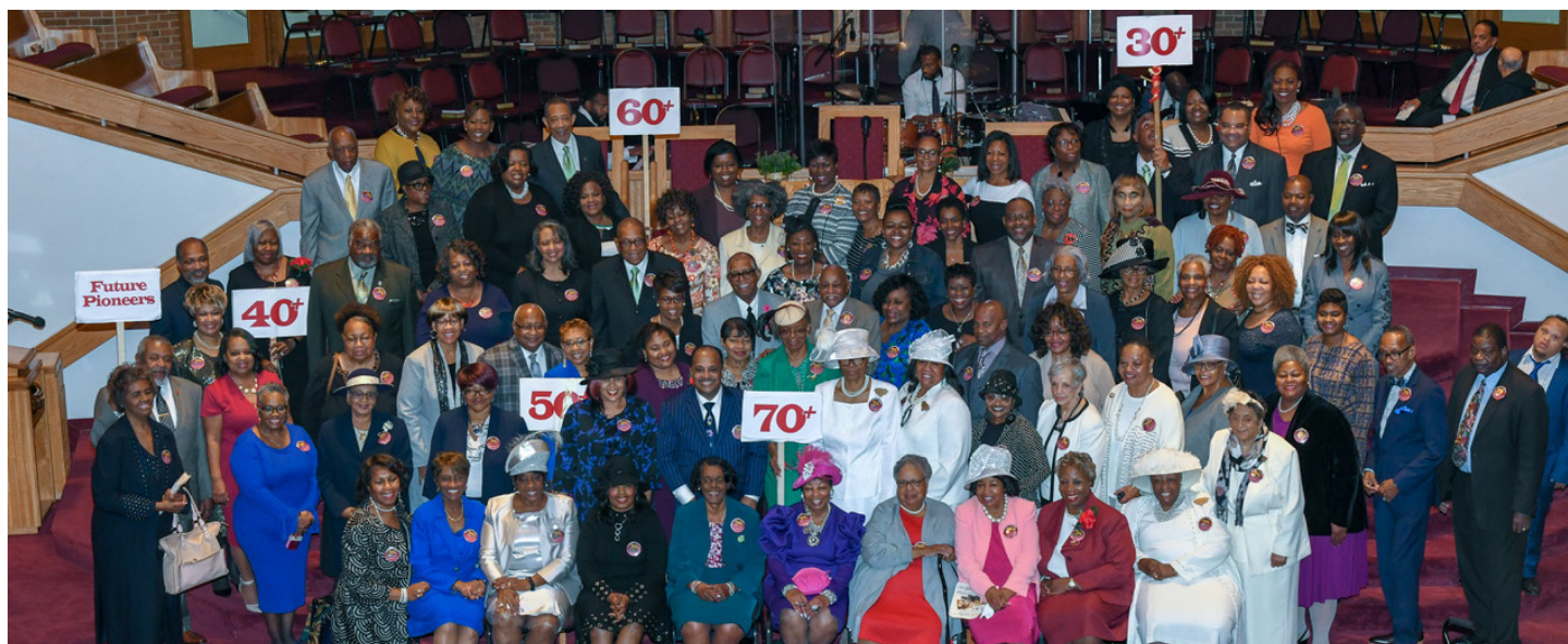
Antioch celebrated its longest-serving and most dedicated members with its annual Pioneers recognition held on Nov. 4. The Sunday service featured a processional of members who have served for 30-plus, 40-plus, 50-plus, 60-plus, and 70-plus years. "Future Pioneers" of 25-plus years of service were recognized as well.