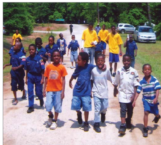
Scouts head for their next adventure.

The unit does traditional Boy Scouts activities, such as going camping. Most of the money to run the unit comes through donations gathered by Deacon Joseph Beasley. Its most important goal is mentoring the 44 boys in the unit into strong African-American men.