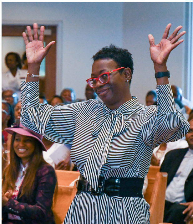
Ohio Sen. Nina Turner