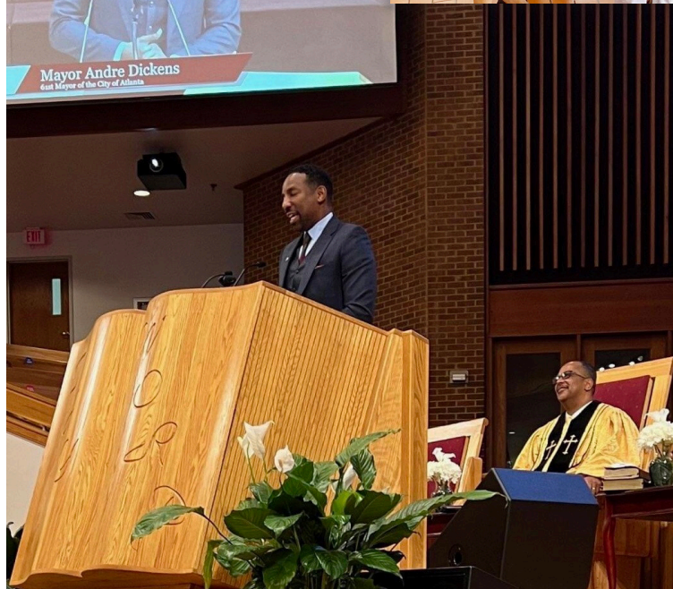
Atlanta Mayor Andre Dickens