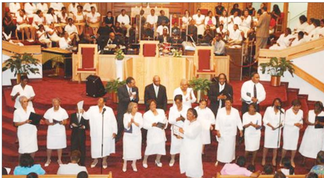
Antioch's Note Singers perform during the Spring Concert

• The selection "Be Blessed," which included a moving presentation from members of the Signing Ministry, filled the church with Holy Ghost