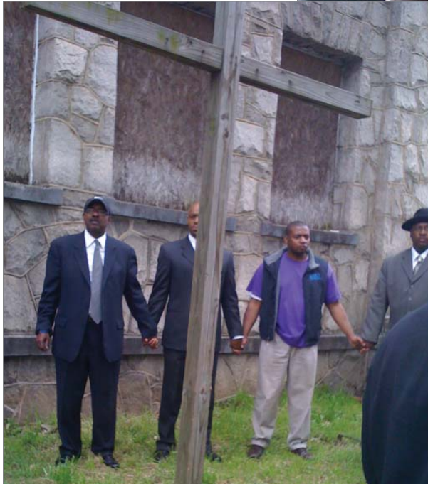
Circle of Prayer at the Street Corner Preaching