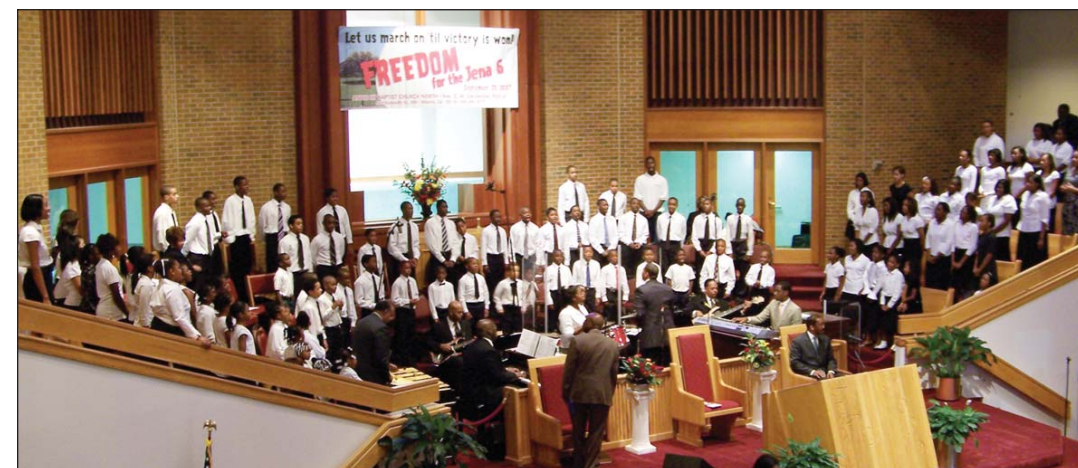
MADD for Christ choir lifts the Lord in song during Youth Division culmination service. Story on page 6.