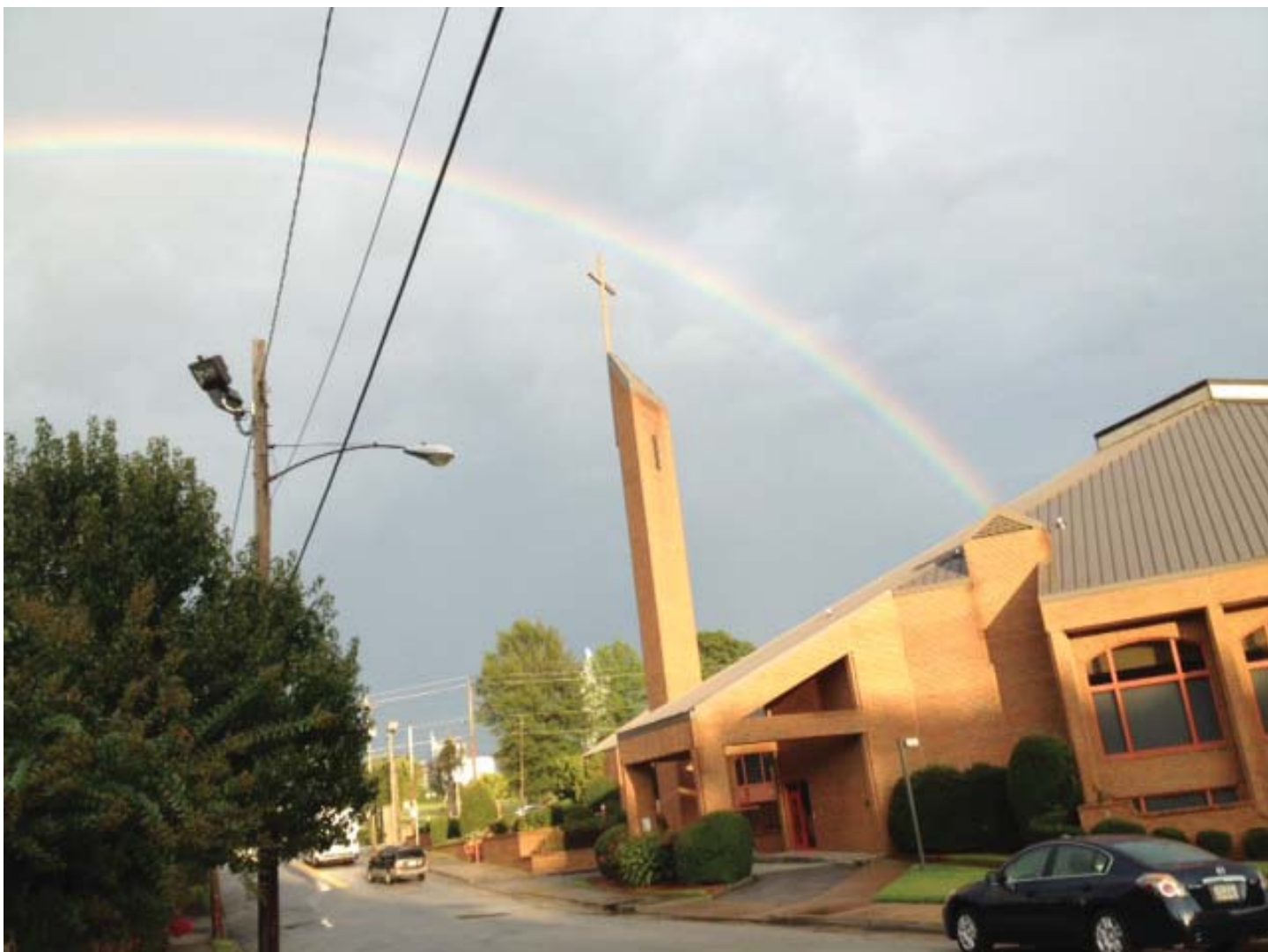
After a brief rain last month, a choir member snapped this breath-taking photo of a rainbow over Antioch Baptist Church North with her cell phone. The photo was a reminder of Genesis 9:16 in which God said: “And the bow shall be in the cloud; and I will look upon it, that I may remember the everlasting covenant between God and every living creature of all flesh that is upon the earth.”