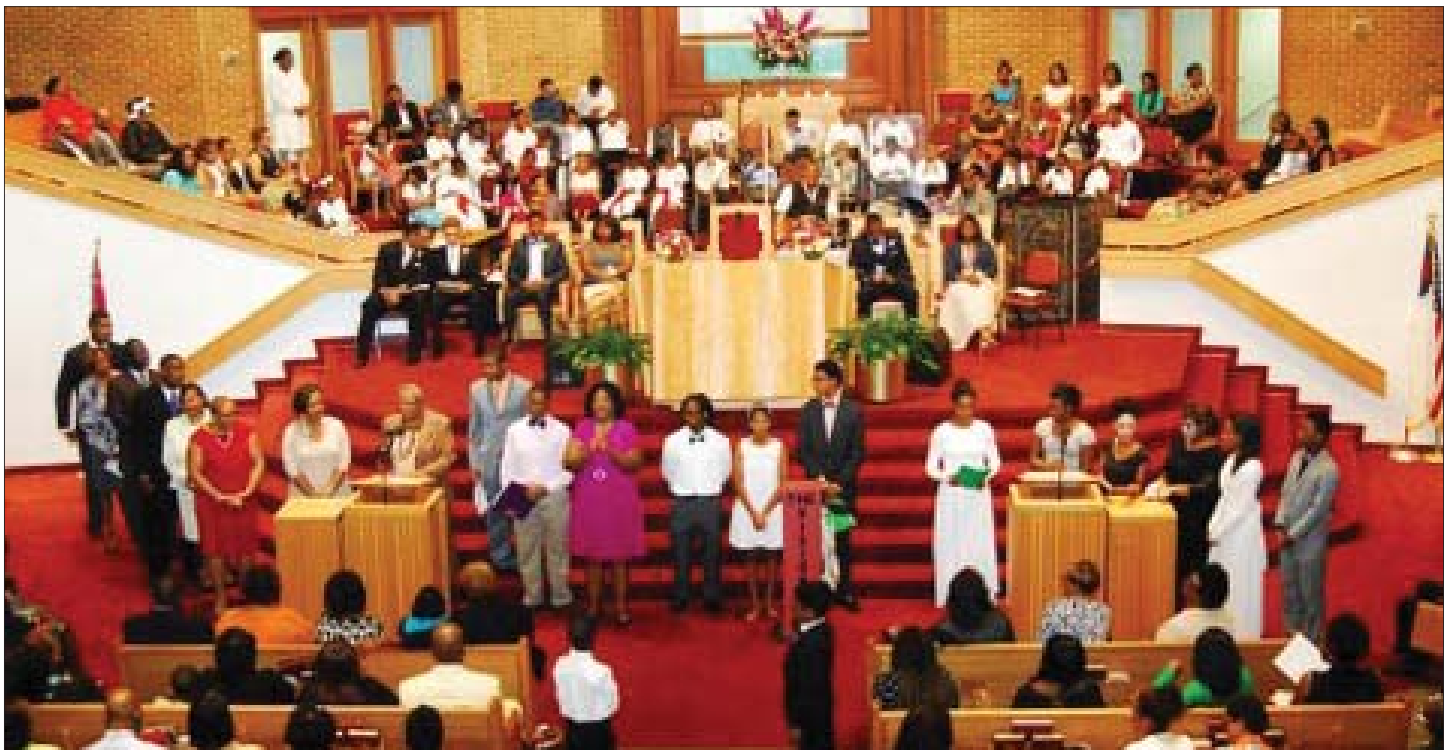
Youth Division culminates with a successful quarter focused on FELLOWSHIP.