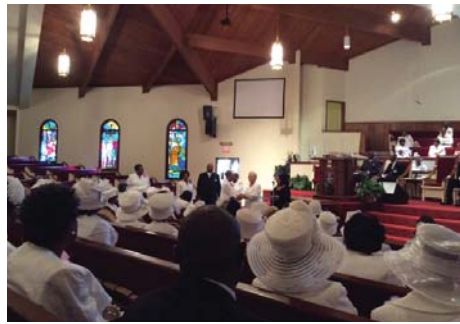
Deaconesses in conference

"Why I Am A Baptist," "Seasoned Servants," Church Etiquette" and