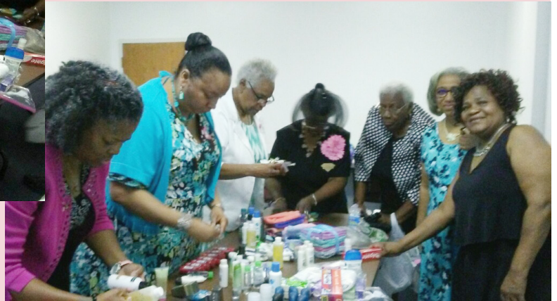
The Women's Missionary Ministry of Antioch Baptist Church North has been busy assembling personal care bags for distribution at the church's food bank. Members assembled 36 personal bags in June and again during Easter for the Street Corner Preaching. They plan to continue this as a quarterly project.