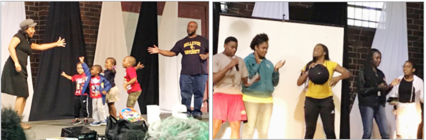
Scenes from Antioch's Vacation Bible School

A record 600 youth and adults turned out in June for Vacation Bible School, where the plan of salvation was reinforced and students were encouraged to stay in the race for God.