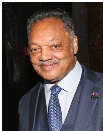
Rev. Jesse Jackson

"He is still my hero," he said, referring to Jackson. "I saw