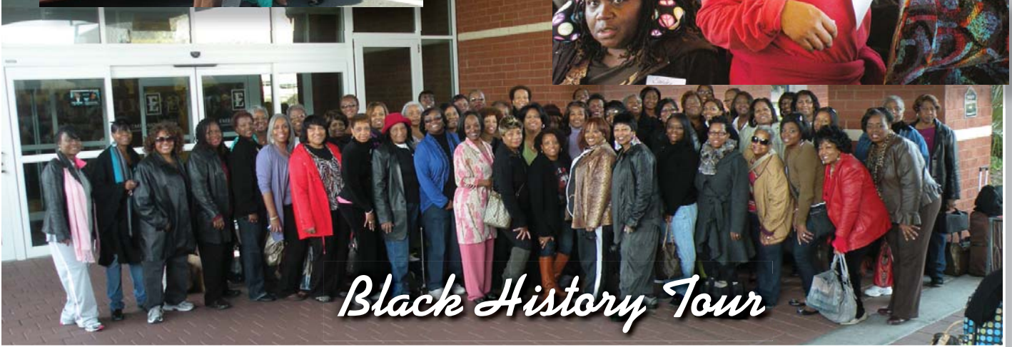
Black History Tour