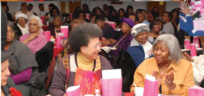
Women's Prayer Breakfast