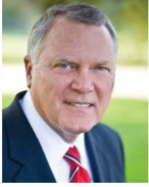
Nathan Deal GOVERNOR