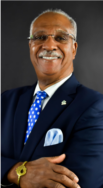
President, Interdenominational Theological Center (ITCC)