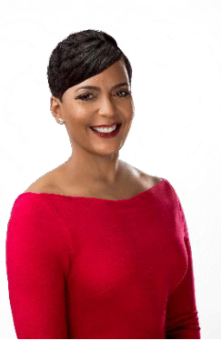
KEISHA LANCE BOTTOMS MAYOR