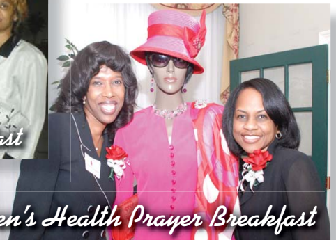
Women's Health Prayer Breakfast