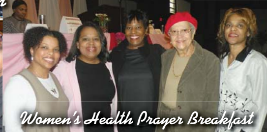
Women's Health Prayer Breakfast