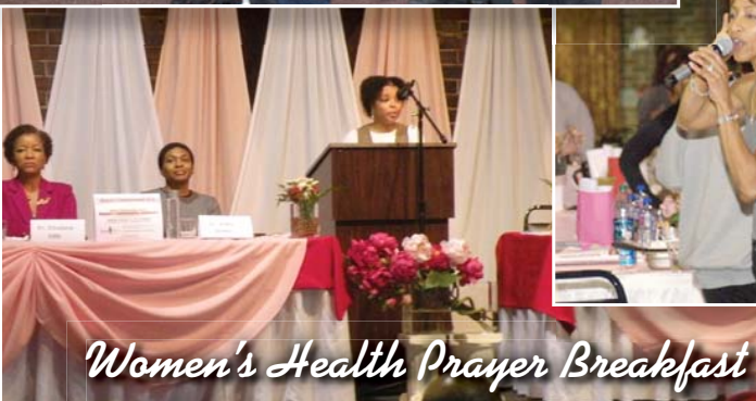
Women's Health Prayer Breakfast