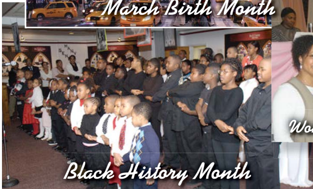
Black History Month