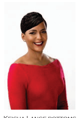
KEISHA LANCE BOTTOMS MAYOR