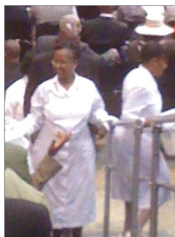
Antioch Ushers at convention