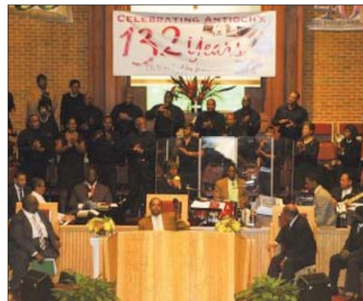
Antioch's Choir sings during the 132nd Anniversary Celebration.

Antioch hosted its annual Christmas Tree Extravaganza was held on Friday at 7 p.m. on Dec. 4. Well-deserving families will receive a fully-decorated Christmas tree prepared by the ministries and auxiliaries of Antioch.