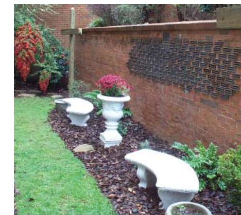
Antioch's Memorial Prayer Garden