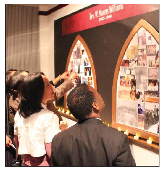
Members view the 134th Anniversary Pictoral History in Fellowship Hall.