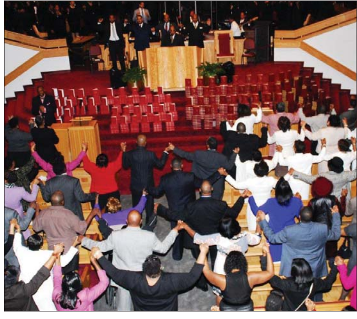
"Through many dangers, toils, and snares...

"Everybody who carries around a big Bible, every new bishop's case is not