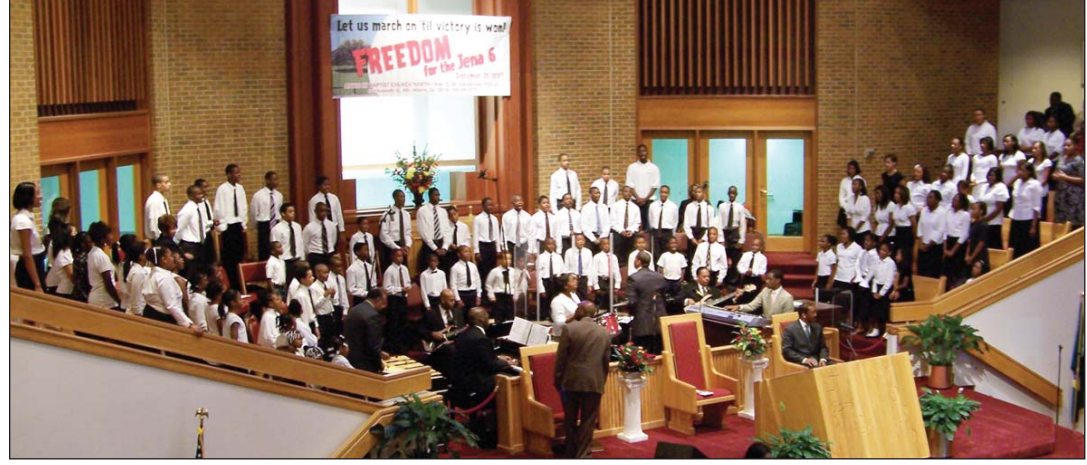
MADD for Christ choir lifts the Lord in song during Youth Division culmination service. Story on page 6.