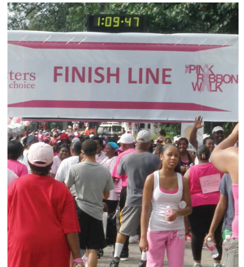
Crossing the finish line.