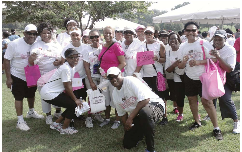
Antioch walkers gather for a group photo shoot.

For more info, visit the American Cancer Society's website at www.cancer.org or call 1-800-277-2345.