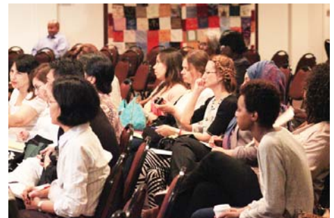
The crowd listens intently

For more information on the forum, tapes can be obtained from the