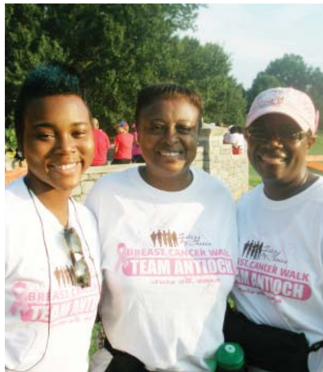
More photo opportunities