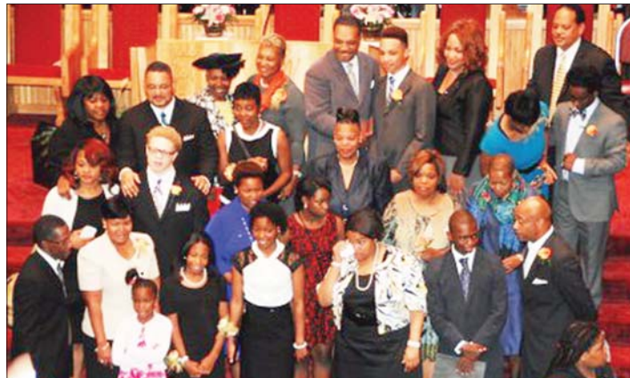
Youth speakers gather with family members.

They read scripture and prayed prayers. They danced and played songs of praise. They set our