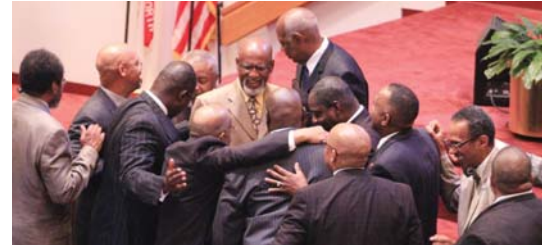
Deacons gather for a big anniversary hug.