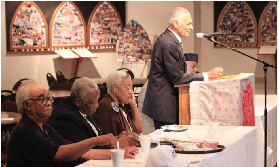
Rev. C. T. Vivian addresses the crowd as other speakers look on.