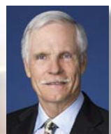
Mr. Robert E. "Ted" Turner, III