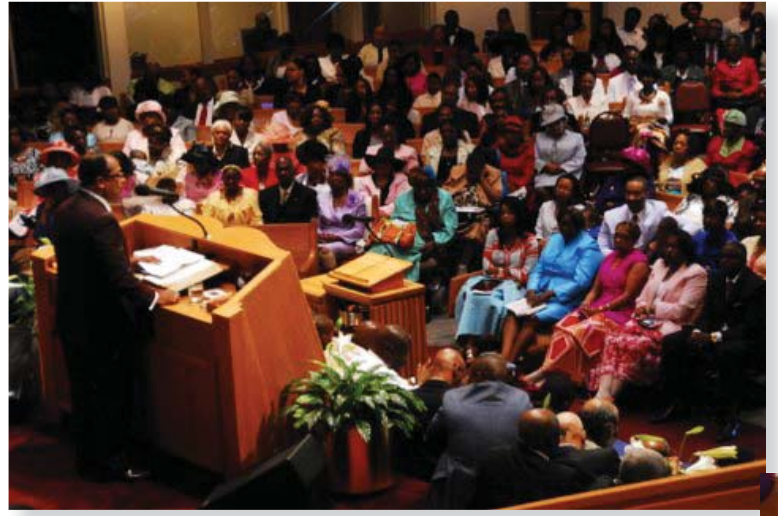
A Taste of Antioch