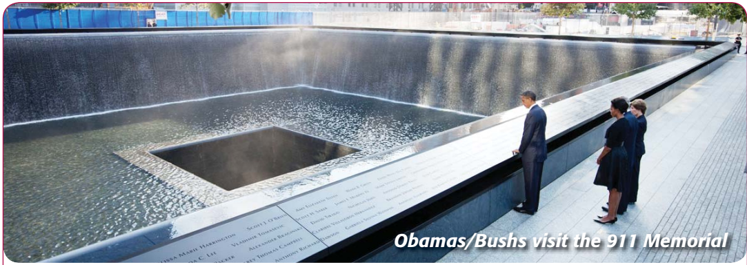
Obamas/Bushs visit the 911 Memorial