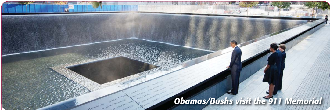
Obamas/Bushs visit the 911 Memorial